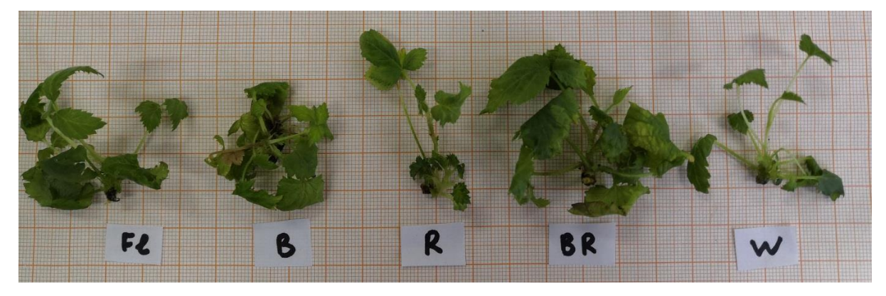
Figure 1. Red raspberry ( Rubus idaeus L. 'Lloyd George') plantlets grown at different light quality treatments. FL - Fluorescence lamps (Control), B – blue LEDs, , R – red LEDs, RB – mixed LEDs, W - white LEDs.

blue LED light. Increased growth of in vitro cultured plants provided with red light was also observed in Vaccinium corymbosum (Hung et al. 2016), Scrophularia takesimensis (Jeong and Sivanesan 2015), Oncidium spp. (Chung et al. 2010) and P. amboinicus (Silva et al. 2017). According to Manivannan et al. (2015) this growth may be related to the ability of red light to induce the formation of endogenous gibberellins, important growth regulators involved in cell elongation.