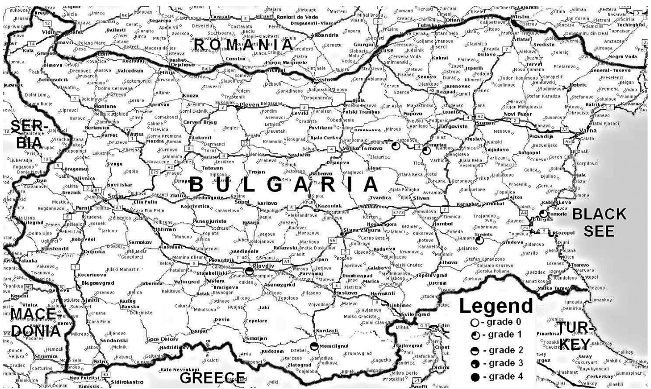
Fig. 5. Distribution and infestation of Brachycaudus persicae on peach in Bulgaria during 2013/2017