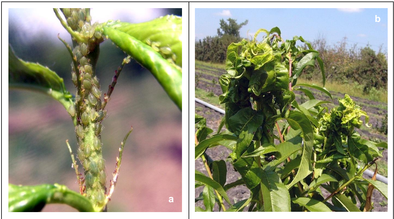
Pict. 1. Myzus persicae – colony of apterous forms (a) and damage (b)