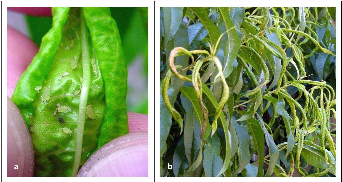
Pict. 2. Myzus varians – colony of apterous forms (a) and damage (b)