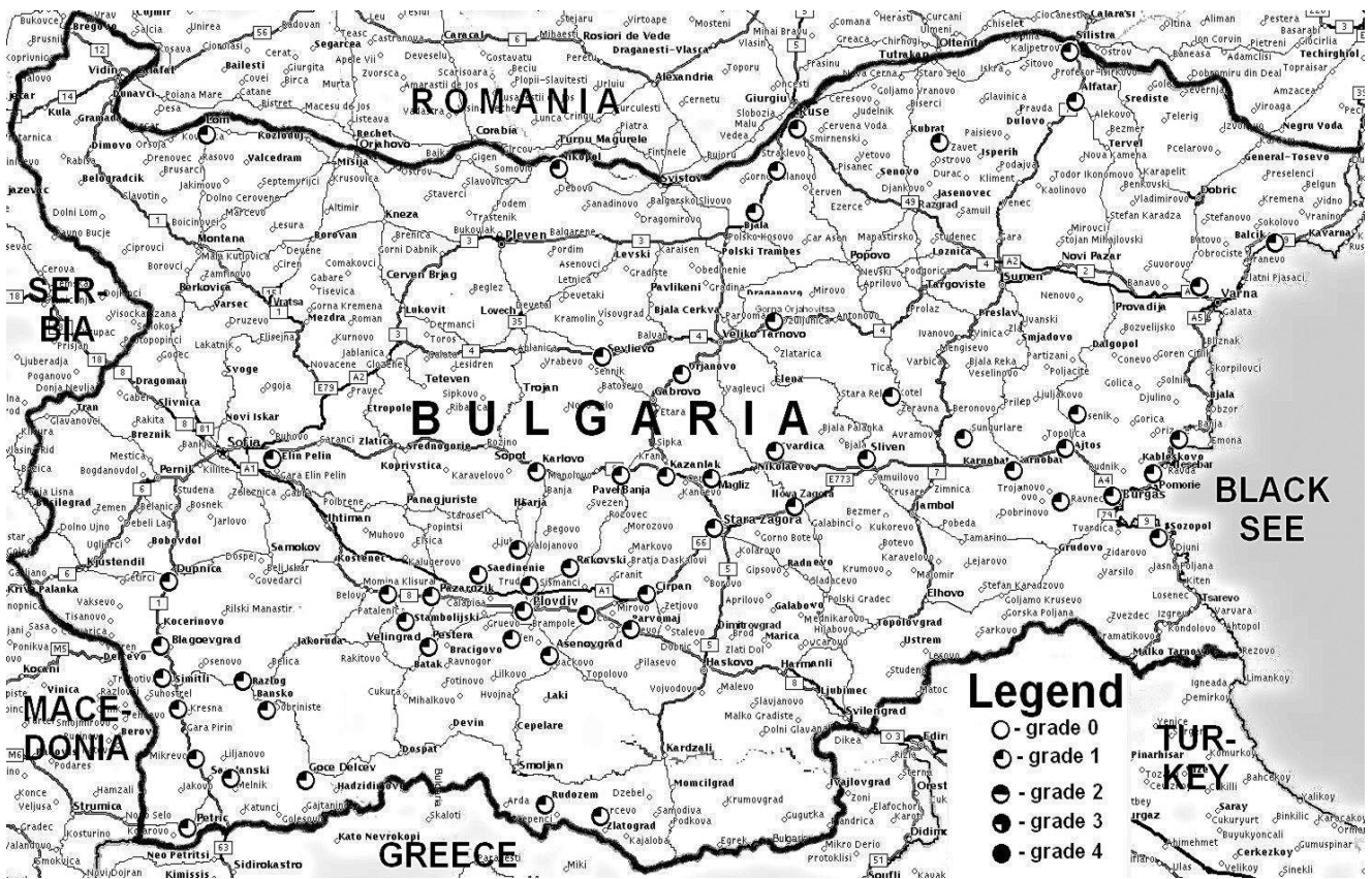
Fig. 3. Distribution of Brachycaudus schwartzi on peach in Bulgaria during 2013/2017