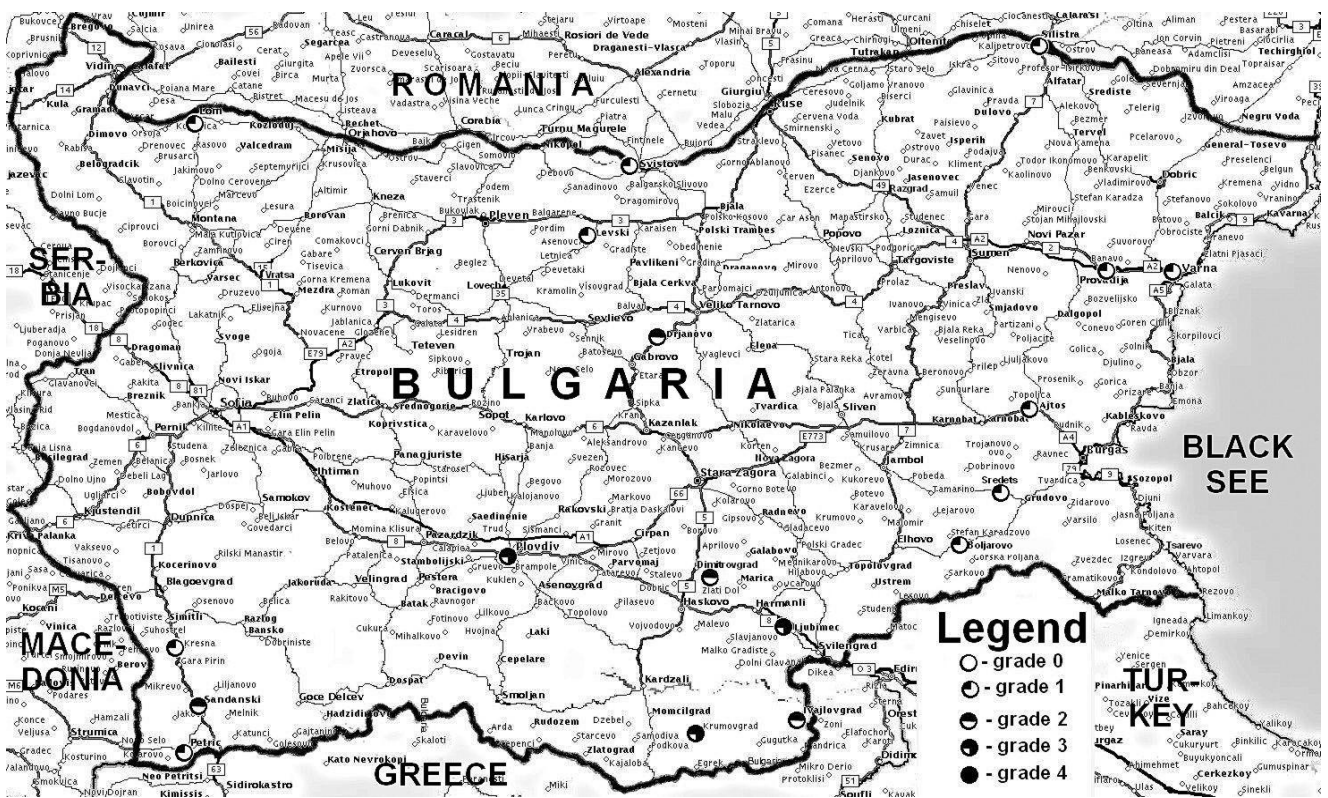
Fig. 4. Distribution and infestation of Hyalopterus amygdali on peach in Bulgaria during 2013/2017