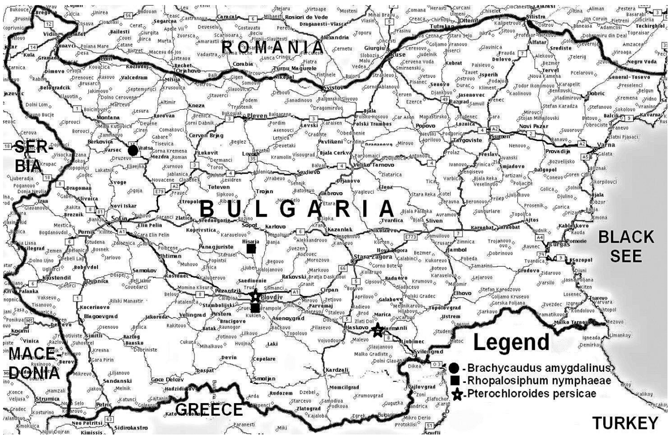
Fig. 6. Distribution of Brachycaudus amygdalinus , Rhopalosiphum nymphaeae and Pterochloroides persicae on peach in Bulgaria during 2013/2017