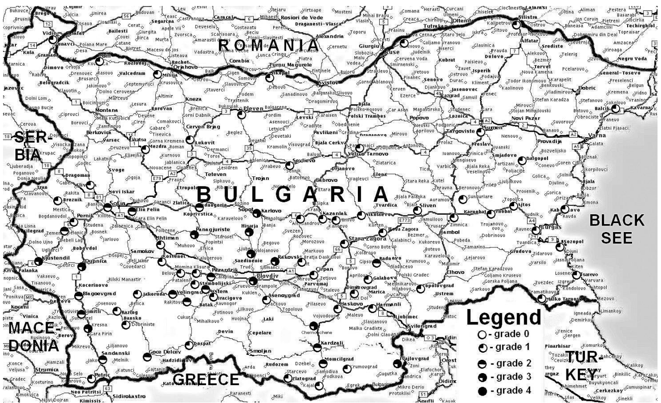
Fig. 1. Distribution and infestation of Myzus persicae on peach in Bulgaria during 2013/2017