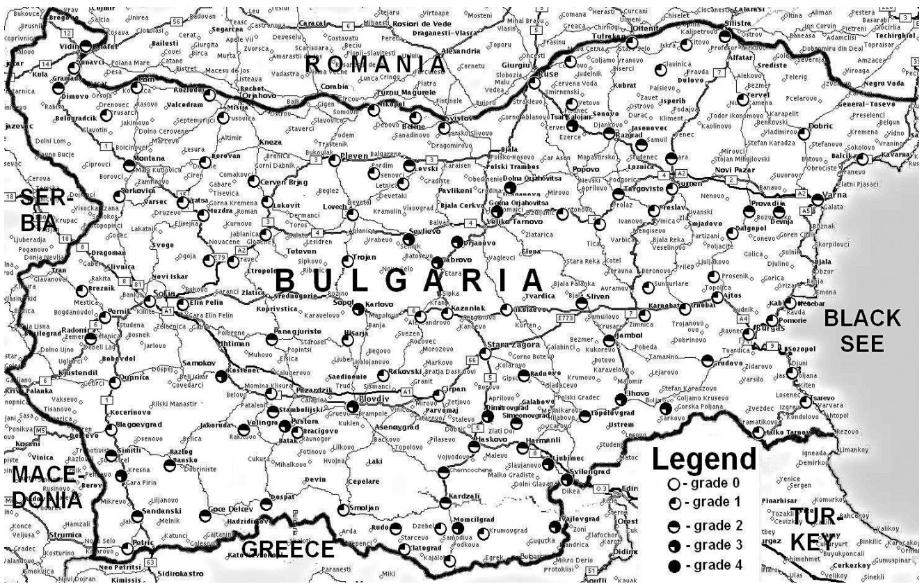
Fig. 2. Distribution and infestation of Myzus varians on peach in Bulgaria during 2013/2017